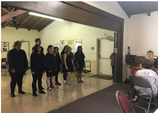
Choir Members from one of the Lompoc High Schools